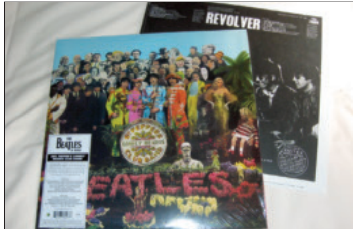
The set re-creates the original album covers with amazing details.