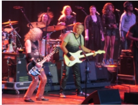
Joe Walsh enchanted a Fort Wayne audience on Tuesday when he performed at Foellinger Theatre. The hits from the Eagles were particularly popular.